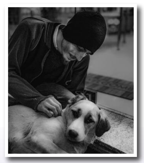
Thanks to your support and to the Dublin Society for the Prevention of Cruelty to Animals, a free biweekly veterinary clinic at MQI is helping the pets of people with no homes – and helping the people, too.

n 2017, the Dublin Society for the Prevention of Cruelty to Animals (DSPCA) approached MOI with a powerful idea. As the numbers of people on Ireland's streets continued to climb, they wondered: could they host a biweekly clinic at MOI offering free drop-in veterinary care for the