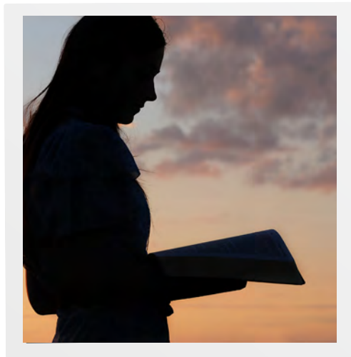
You will not only be remembered. At the heart of MQI, your story will live on.

The MQI Book of Love will be cherished here forever, always growing as more of our MQI family add to it. It will be read by clients in recovery at St. Francis Farm and High Park, year after year.