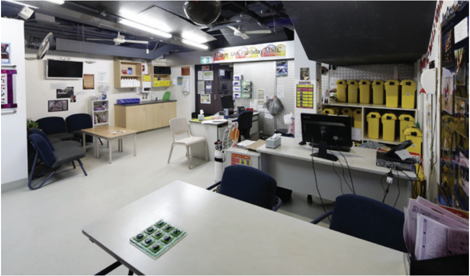
Aftercare Area, Sydney