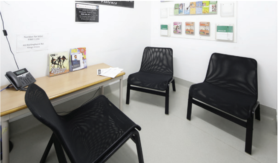
Clinical Room, Sydney