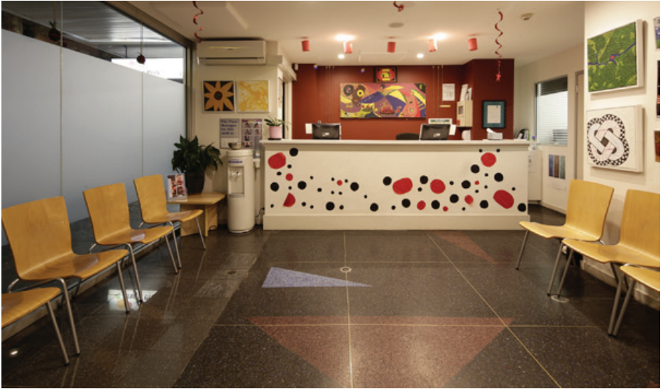
Waiting Room, Sydney