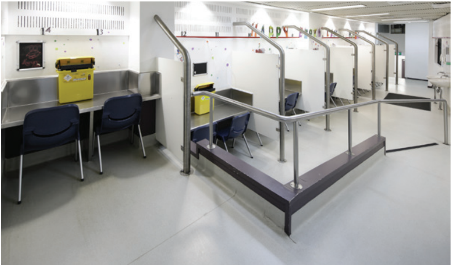
Injection Booths, Sydney