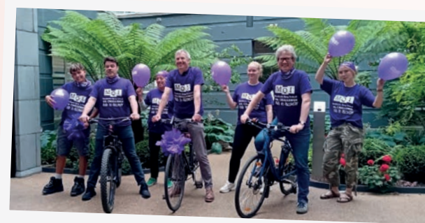
Team MOI Cycle Challenge

As the leaves changed, so did the lives of countless individuals thanks to your incredible support during Recovery Month. You took on the 80km Challenge, lacing up your shoes, hopping on your bikes, and diving into the water – moving however you could raise vital funds and awareness for those recovering from addiction.